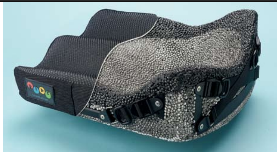
▲ The Ride Custom Cushion

For people at higher risk for skin breakdown, and/or more challenging postural control needs, the Ride Custom Cushion is the ultimate in postural support and skin care.