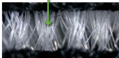
▲ Spacer fabric in cover.