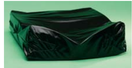
▲ Inner incontinent resistant cover, shown from the rear.

The cushion contour, spacer fabric outer cover and inner incontinent resistant cover all work together to keep the user and cushion dry. The inner cover really works. There are no seams or zippers in the path of liquid drainage, ensuring the cushion will not absorb moisture. Large accidents or spills simply pour off the back of the cushion.