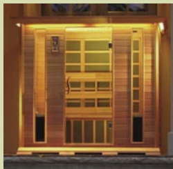
Stunning exterior lights