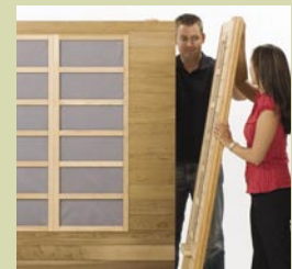
Patent pending magnetic assembly

*AM/FM radio signal may not be available in all areas