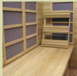
Reversible, deeper bench